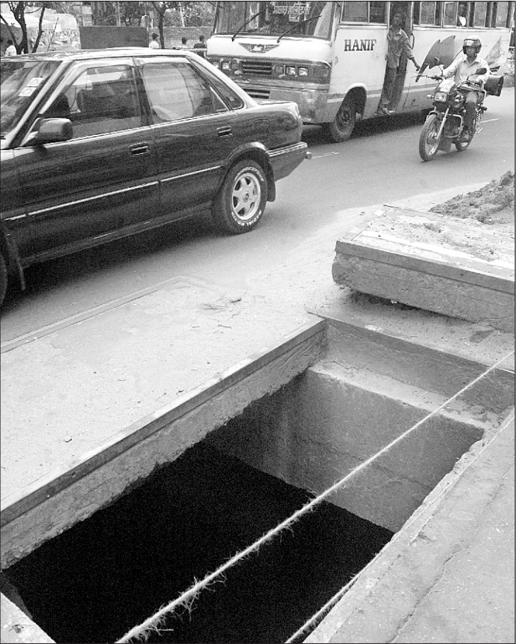
This open manhole near the Samorita Hospital in Panthapth poses danger to commuters.