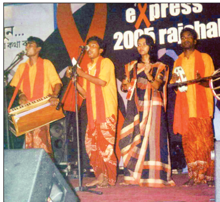
Artists performing at the event

Expressing anxiety over the serious risk of HIV/AIDS in Bangladesh, the speakers called on people to generate information about the terminal illness. There is no room for procrastination, they said, as the disease might strike anyone. "If all of us talk openly about