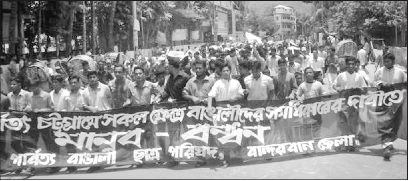
Several hundred people joined a human chain followed by a procession in Bandarban town yesterday organised by CHT Bangalee Chhatro Parishad demanding a fair development policy for the area.