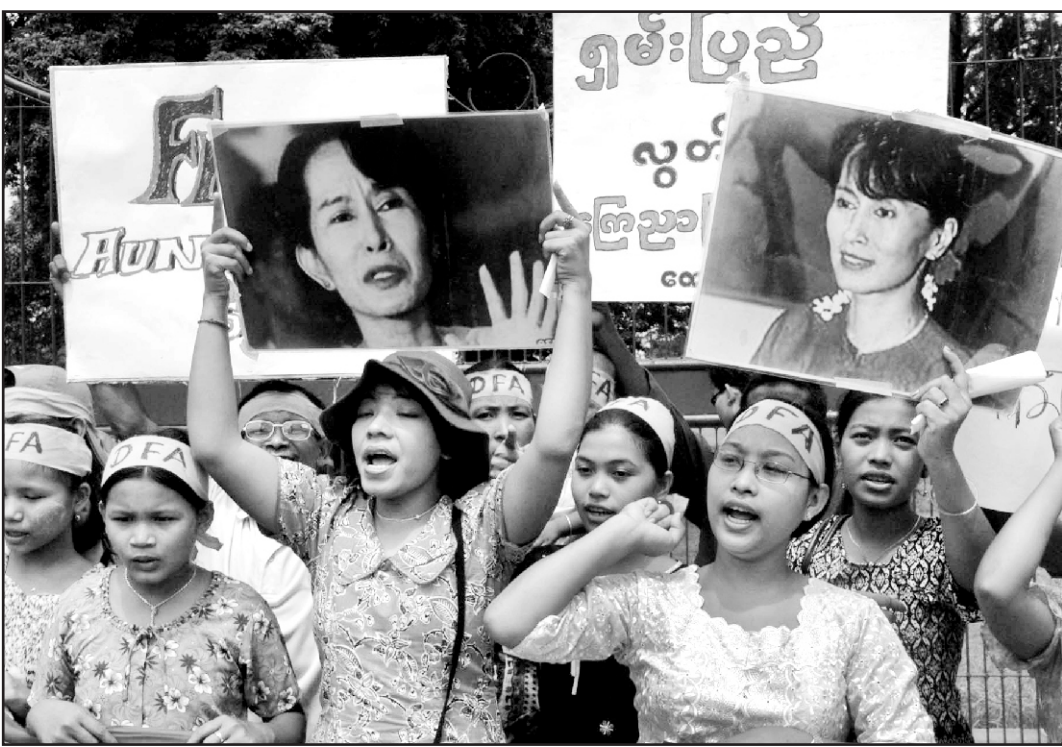
Citizens of Myanmar residing in Bangladesh stage a demonstration in front of the High Court in the city yesterday demanding release of Aung San Suu Kyi.