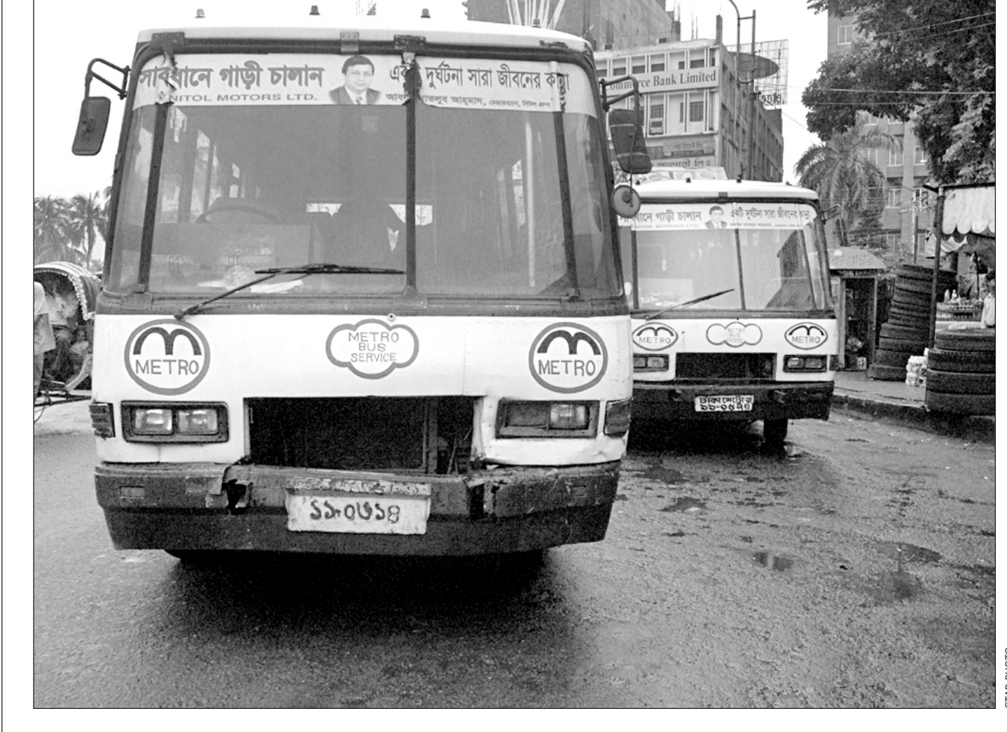
The expansion of the Premium Bus service is at a standstill, as they are yet to receive diversified route permits

"There will be a follow-up meeting within June 25 where a detailed monitoring session will be held on the progress of the beautification work," said Chief Conservancy Officer of DCC Sohel Farouquie.