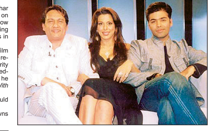
(L-R) Shekhar Suman, Pooja Bedi and Karan Johar

The tables have turned. While Karan Johar and Shekhar Suman usually grill pretty actresses on their successful television shows, now Pooja Bedi has reversed the pecking order and put the two talk-show hosts in her hot seat. So Karan reveals his favourite film director, the fact that he's okay with re-editing his show if his guests and celebrity friends object to even one hastily uttered line and how a fan once suggested that he start a children's show, Toffee With Karan!