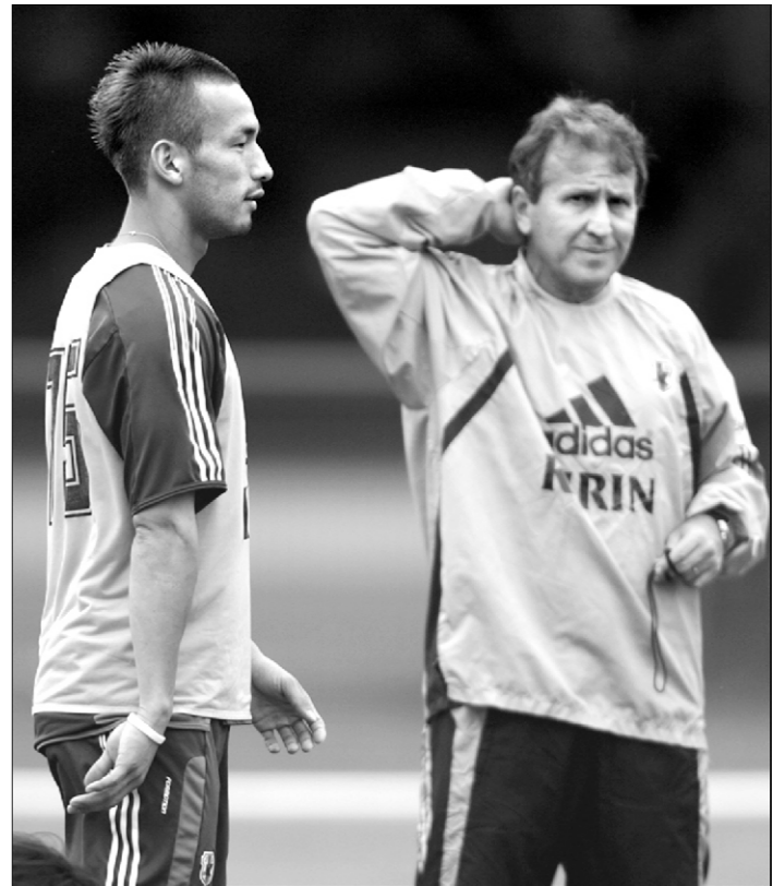
SHOW ME SOME OF YOUR OLD SPARK! Japan coach Zico (R) watches veteran midfielder Hidetoshi Nakata during a training session at the SportsPark in Hanover on Tuesday.

"The competition will give us an idea of what we will find in 2006 and allow us to compare ourselves against teams of high potential."