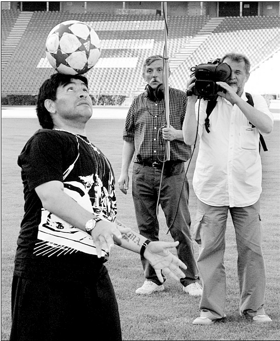
STILL GOT THE SAME CONTROL: Argentine idol Diego Maradona (L) balances a ball at the Red Star stadium in Belgrade on Tuesday while he is filmed. Maradona is in the Serbian capital working on a documentary about his life.

His latest full-length movie, "Life is a Miracle", was filmed in Serbia and released last year.