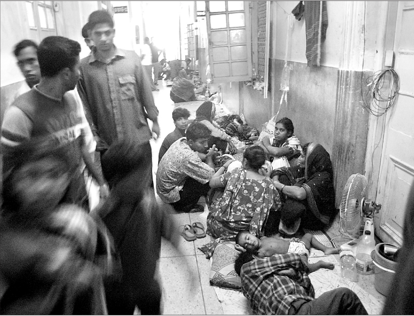
Patients wait impatiently in the department to receive treatment.

KAUSAR ISLAM AYON The emergency operation theatre of the neurosurgery department at Dhaka Medical College Hospital (DMCH) has failed to provide proper service for the last 14 months.