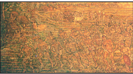
An art work by SM Sultan