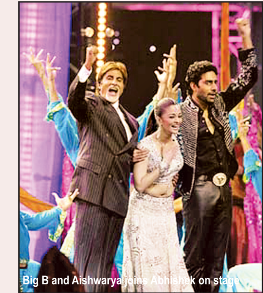
Big B and Aishwaryajins Abhishek on stage

Bollywood superstars Shahrukh Khan (Veer-Zaara) and Rani Mukherjee (Hum Tum), walked away with the Best Actor and Actress trophies as Yashraj Film's Veer-Zaara bagged six awards at the International Indian Film Academy (IIFA) Awards ceremony in