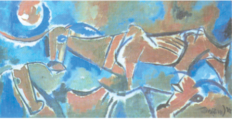
Cattle in moonlight by Quamrul Hassan