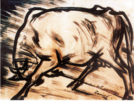
Rebel cow by Zainul Abedin