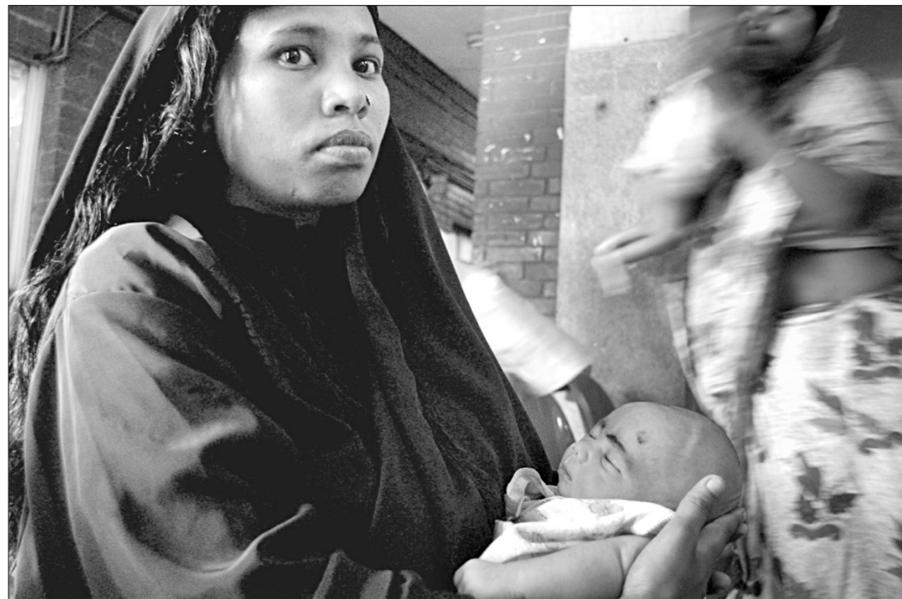
A seven-day old at the Shishu Hospital suffers from jaundice caused by the acute heat according to the duty doctor.

According to DCC sources, the park now has an area of 19.6 acres although originally it was 23.14 acres. Some 2.81 acres of land on the eastern side is the subject of a legal dispute with one woman claiming ownership of that land. She has also filed a case with the high court. Besides some portions have been handed over to the Golap Shah Mosque while Muktijoddha Sangsad Kirra Chakra club, a group of typists, Titas Gas, the Water and Sewerage Authority (WASA) and Dhaka Metropolitan Police are using land originally belonging to the park.