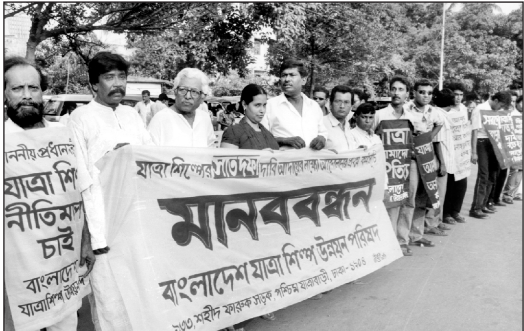
Bangladesh Jatra Shilpa Unnoyan Parishad forms a human chain at Muktangan in the city yesterday to realise its seven-point demand.