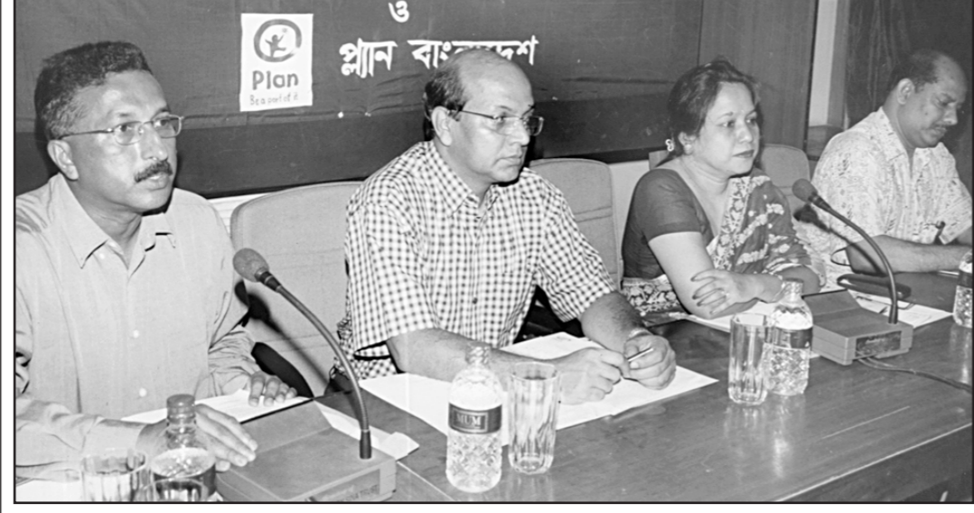
Bangladesh Shishu Adhikar Forum held a press conference at the National Press Club in the city yesterday on the occasion of the World Day Against Child Labour.

A former leader of Jatiyatabadi Chhatra Dal (JCD) yesterday urged the prime minister to ensure the security of him and his family members as a quarter has been giving death threats over the telephone.