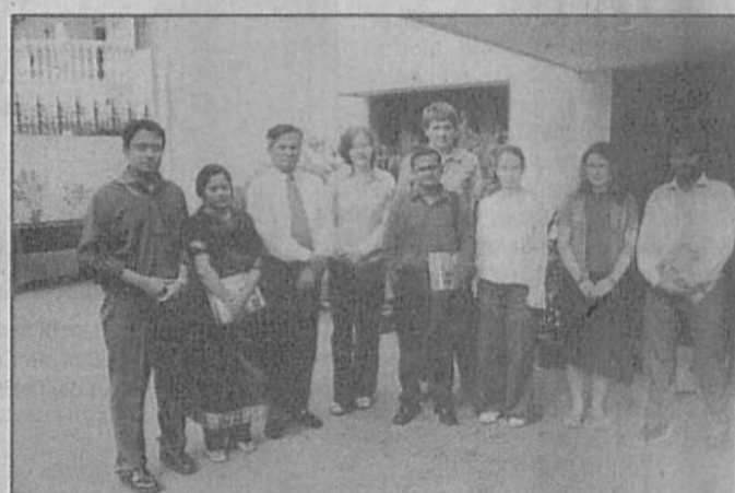
Students from the University of Bath, UK are seen with IUB students and the Vice Chancellor.