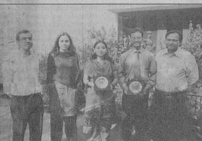
Students of the University who won the first prize in the first ATPD - AIUB Inter-University Business Plan Competition are with the faculty members.