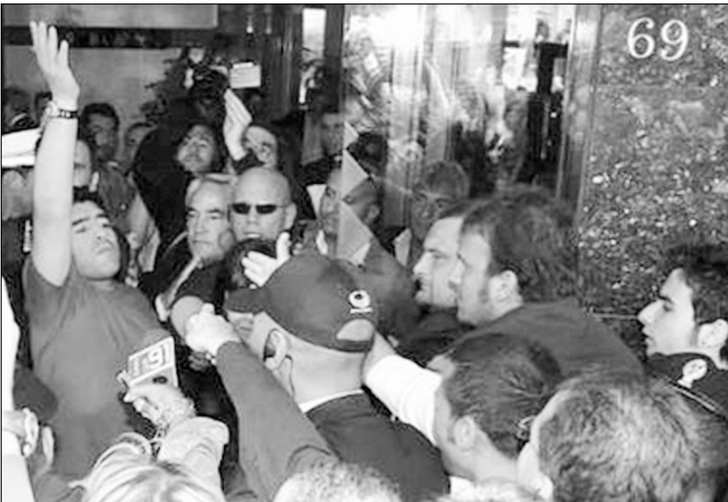
THE IDOL RETURNS: The legendary Diego Maradona (L) waves to fans as he enters his hotel in Naples on Thursday. Maradona returned to Naples, where he played for Napoli from 1984 to 1991, after 14 years.

On Corey Collymore, after he became the first West Indian bowler to take ten wickets against Pakistan in a match.