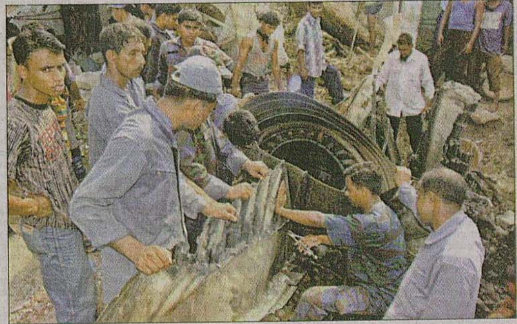
Bangladesh Air Force personnel yesterday conduct salvage operation of the fighter crashed on a house in Uttara on Tuesday.