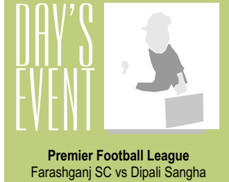
(5:00 pm) enue: Bangabandhu National Stadium