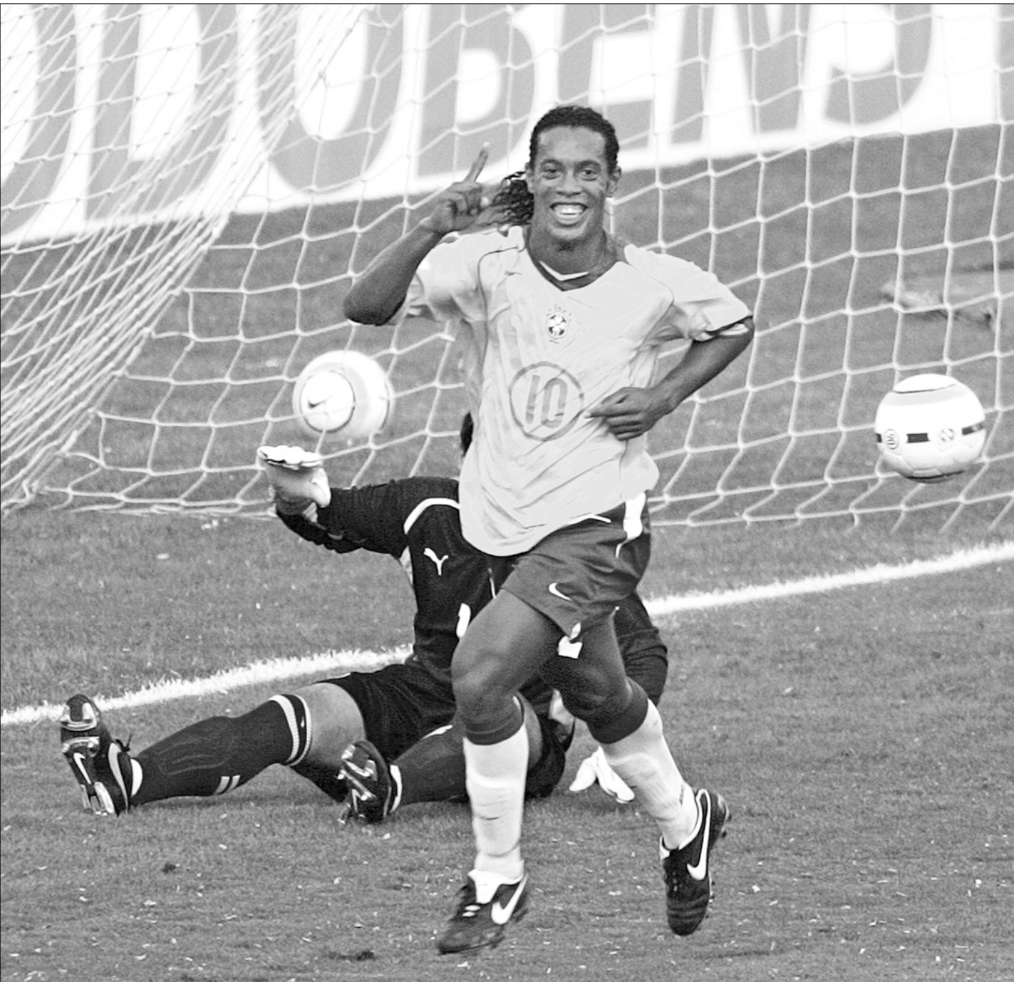
Brazilian superstar Ronaldinho Gaúcho celebrates his second goal from the spot against Paraguay at Beira Rio stadium in Porto Alegre, Brazil on Sunday.