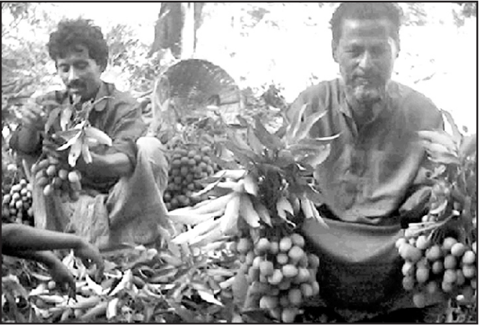
Two litchi growers sorting the plucked fruits.

Nonetheless, life in the village is changing gradually. From profits earned from litchi trees, villagers are now taking to other businesses. Some small poultry and dairy farms have sprang up.