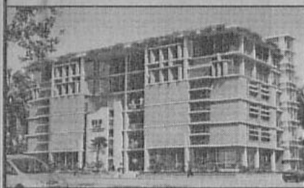
UIU New Campus House No. 80, Road No. 8/A Dhanmondi, Dhaka-1209

On the Occasion of Moving to New Campus Great Opportunity for Brilliant Students Tuition Fee Waiver for the Entire Program