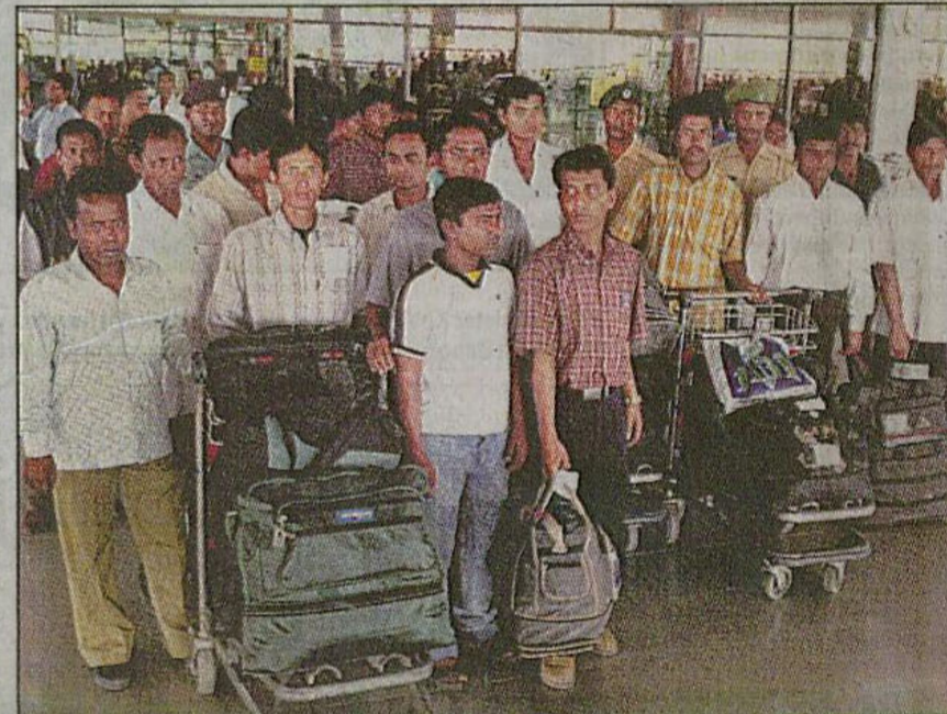
Twenty-eight Bangladeshi workers return home penniless Saturday evening after working six months at a Jordanian garment factory.