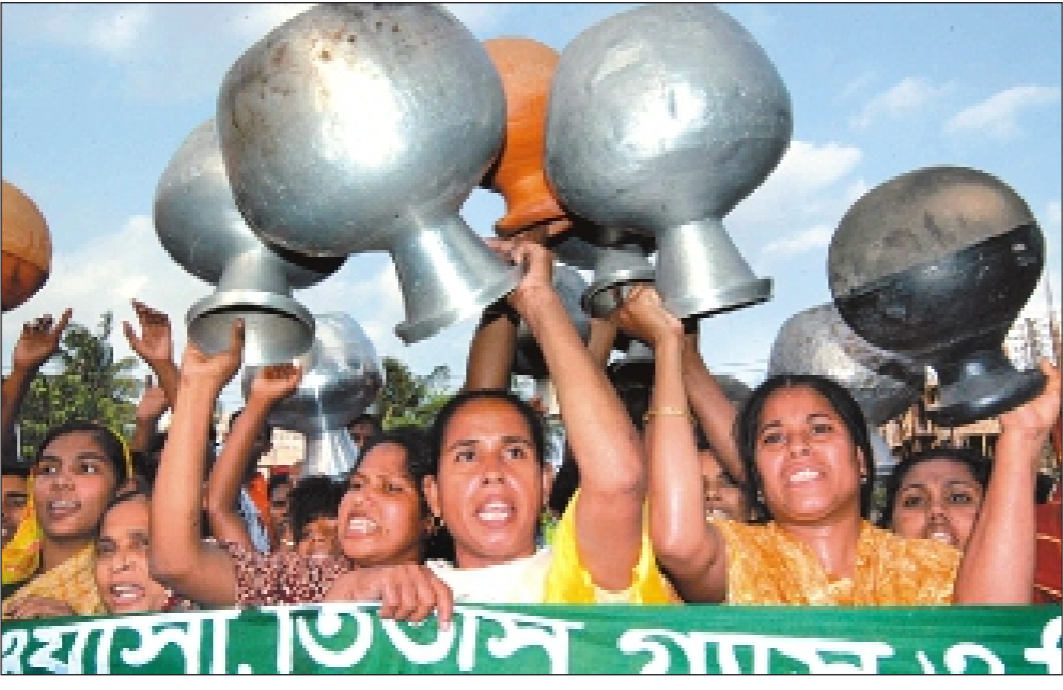
Locals of ward No 21 in the city's Badda area yesterday bring out a procession carrying pitchers, to protest inadequate supply of water, gas and power.