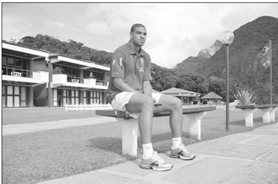
Brazil striker Adriano relaxes in front of the players' cottages at the national team's training base in Granja Comari on Thursday.

Adriano meanwhile realises that Ronaldo's absence gives him the chance to make himself an automatic first-choice player. "I must take advantage to ensure my place in the squad for the World Cup finals. I am going to do everything I