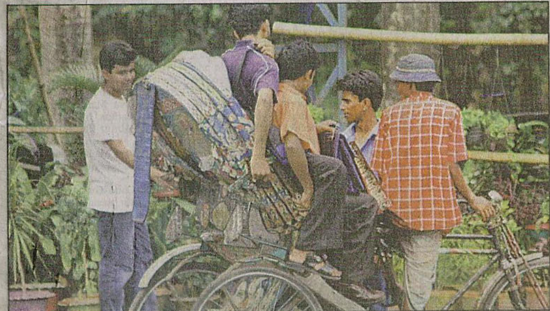
Activists of ruling BNP's student wing Jatiyatabadi Chhatra Dal yesterday stop a rickshaw at the TSC turning on Dhaka University campus, as part of their search for workers of Bangladesh Chhatra League, student front of the main opposition Awami League.