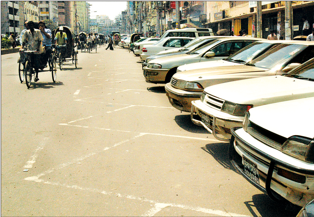
Cars parked along the Dhaka Chamber of Commerce building in Motijheel, one of DCC's parking areas.

Dilkusha is run by L.N Corporation while Selim Corporation controls the area at Baitul Mukarram. The one at Shantinagar is under the care of Classic Builders. The local association of businessmen looks after Krishi Market. Presently parking tolls in the New Market