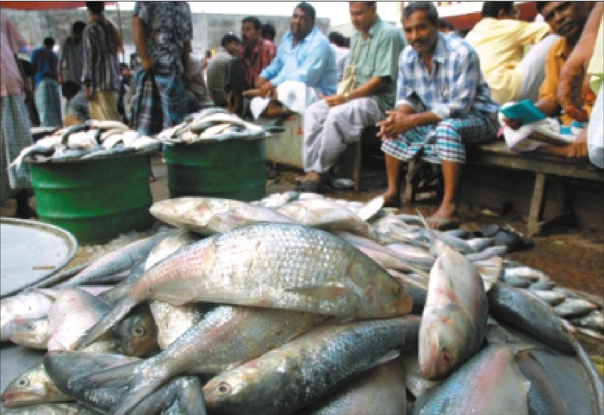
Hiilsha is now available at reasonable prices in city markets following India's decision to suspend fish import from Bangladesh through land ports. The photo was taken at the Swarighat market yesterday.