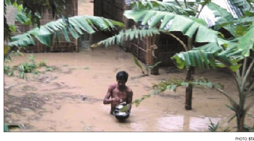
A villager wades through waist-deep water in Moulvibazar as flashfloods engulfed more areas yesterday.