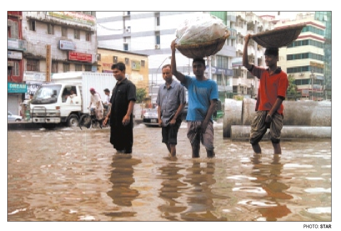
Pedestrians slosh through near knee-deep water on a Naya Paltan road after yesterday afternoon's heavy downpour in the capital.

Devotees pray in Kamalapur Bouddha Bihar yesterday on the occasion of Bouddha Purnima, the biggest religious festival of Buddhists.