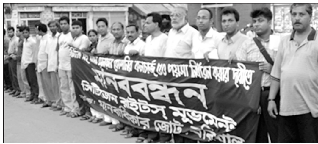
The Citizen Rights Movement organised a human chain in front of Aswani Kumar Hall in Barisal city yesterday demanding reduction of cellphone call charge to 50 paise per minute.