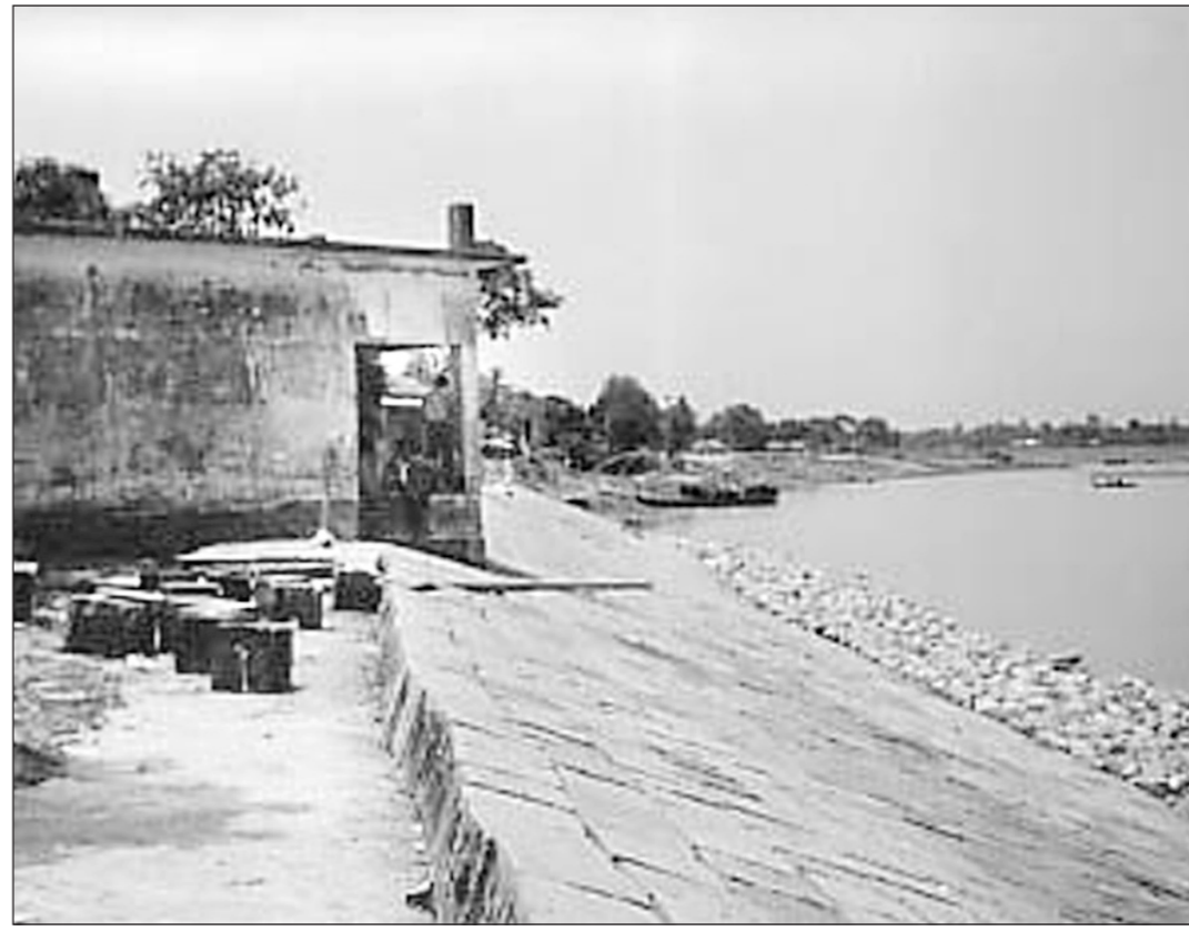
The half-done Fulchhari-Kamarjani port protection project in Gaibandha. It's fate has become uncertain as the government cut the allocations.

About 100 members of the forum took part in the human chain. They demanded life insurance for all launch passengers, ban on overloading of launches, making it mandatory for keeping life saving kits in launch and its plying by trained and expert captain, 'Sukhani' and 'Sareng', ban on transport of goods in passengers launches, introduction of sea-trucks along the coastal areas, making riverine routes safe and cancellation illegal route permits.