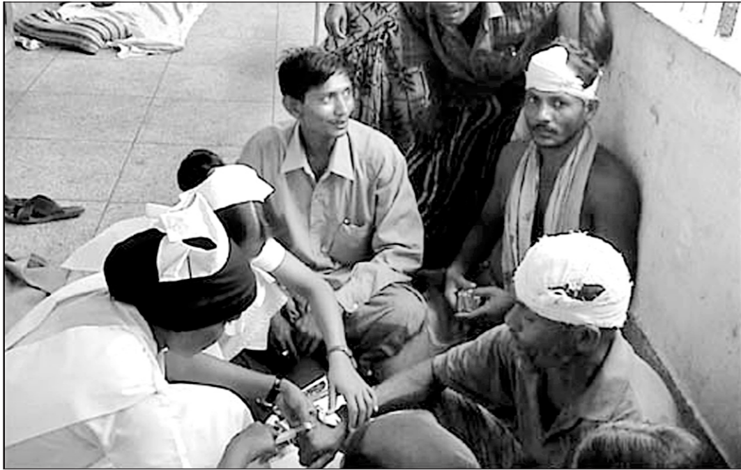
Patients receiving treatment on the floor of Patuakhali General Hospital.

It is gathered that out of required 432, only 140 staff including doctors are now posted there.