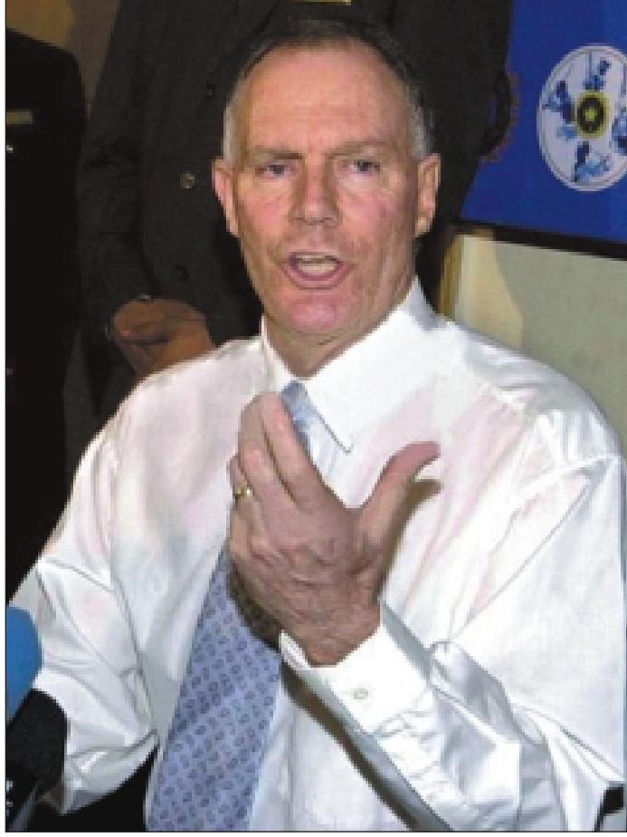
Former Australian captain Greg Chappell addresses a press conference after being selected as India's new cricket coach in New Delhi on Friday.

over the last 10-15 years," he told a press conference. "The good thing is they continue to get better. That is what we have to aim for," he said. "If we don't get that commitment from the players that