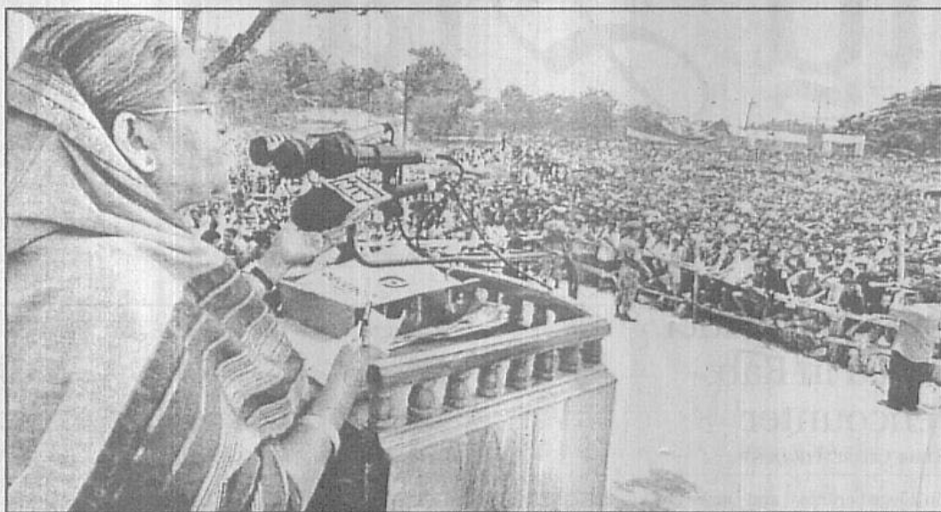
Awami League President Sheikh Hasina addresses a huge public meeting at Bara Moheshkhali Natunbazar Primary School Ground in Chittagong yesterday morning.