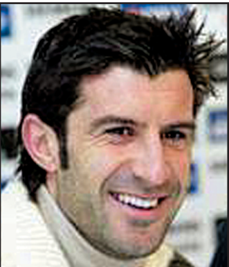
Luis Figo (Real Madrid's Portuguese midfielder)

"I retired from the international scene because I was tired and I wanted to dedicate my remaining years to my club. But as I am not a first choice selection at the moment I have started to think differently."