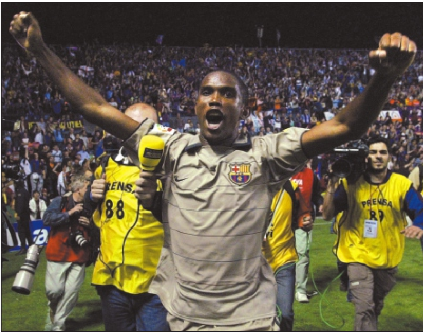
GOALS ALL THE WAY! Barcelona's Cameroon international Samuel Eto'o, Primera Liga's top striker this season, shows his delight after the final whistle in the match against Levante at Ciudad de Valencia stadium of Valencia on Saturday.

"We will continue to monitor their fitness closely and a decision will be made later this week as to their availability for the next round of domestic fixtures starting this Friday