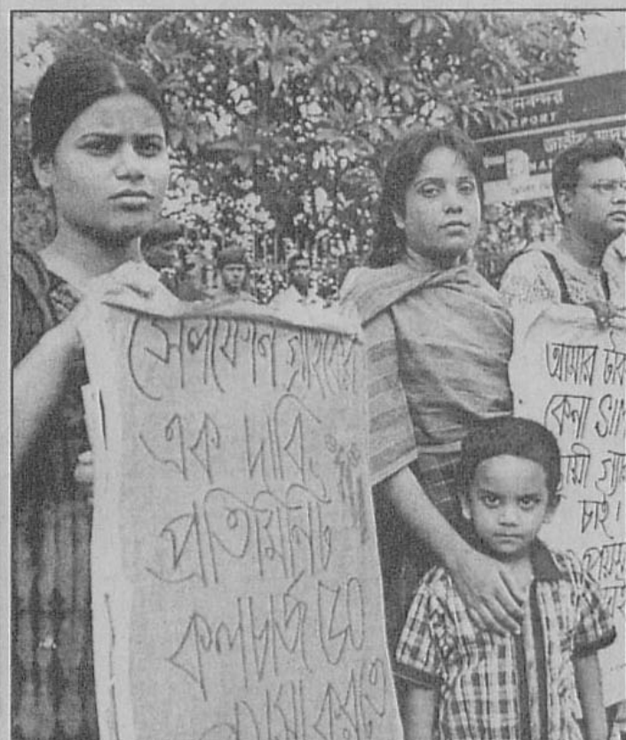
Citizens' Rights Movement forms a human chain in front of the National Museum at Shahbagh in the city yesterday demanding that cellphone call charge be slashed to 50 paisa per minute.