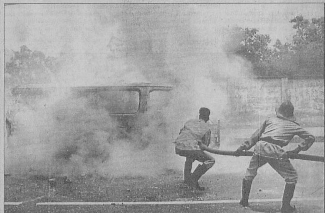
Firefighters struggle to put out a burning microbus at Agargaon in the city yesterday. A mob set fire to the vehicle after it ran over a schoolboy in the area.