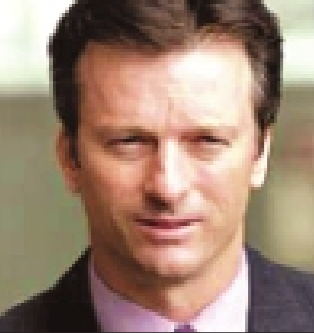
Steve Waugh (Australia cricket legend)

"I do not think action against Sourav is harsh, but the teammates also let him down by not making him alert on the slow over rate."