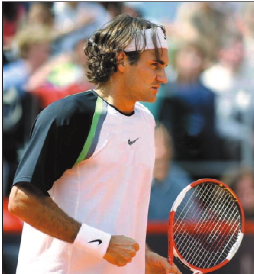
World number one Roger Federer of Switzerland celebrates after winning the match point against Russia's Nikolay Davydenko in the semi-final of the ATP Hamburg Masters tennis tournament on Saturday.

South Africa paceman Makhaya Ntini did most of the damage with 3 for 24 in his first 7-over spell.