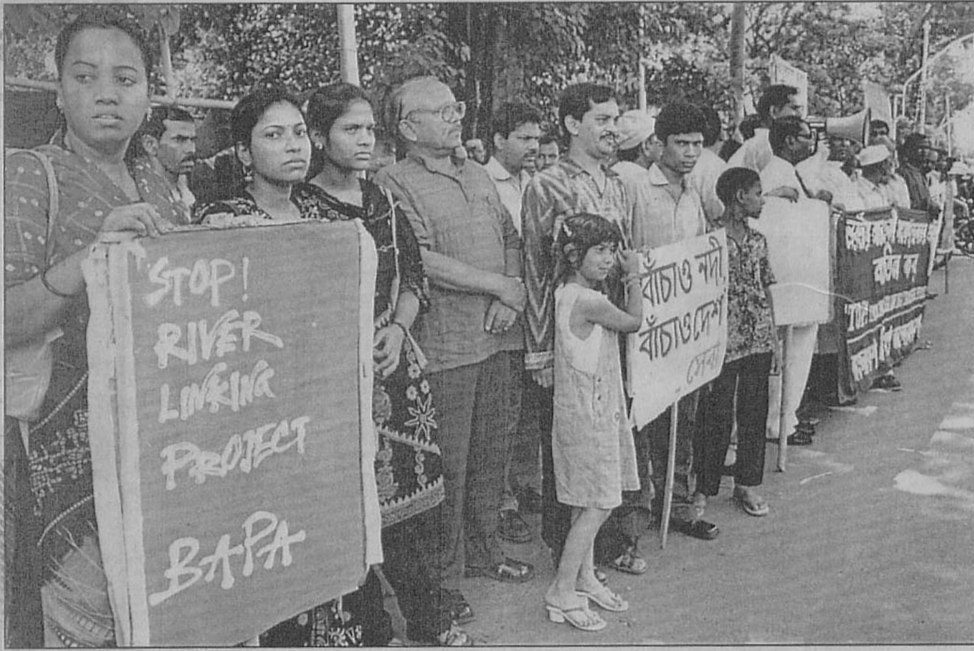
SAVE RIVERS, SAVE THE COUNTRY: Bangladesh Paribesh Andolon forms a human chain at Shahabag in the city yesterday protesting the Indian River-Linking Project.