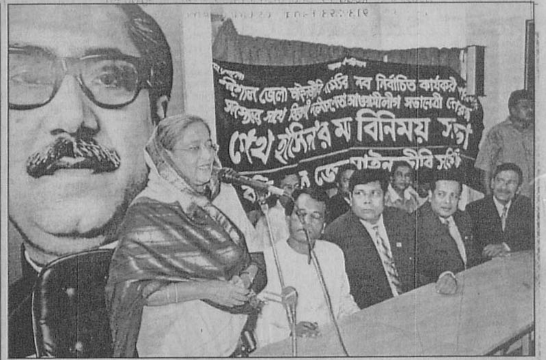
Leader of the Opposition in Parliament and Awami League President Sheikh Hasina speaks at a view exchange meeting with the newly elected office bearers of Barisal and Kushtia district lawyer's associations.

He left behind his 4 sons and five daughters. He was buried at Alipur graveyard in the town with state honour.