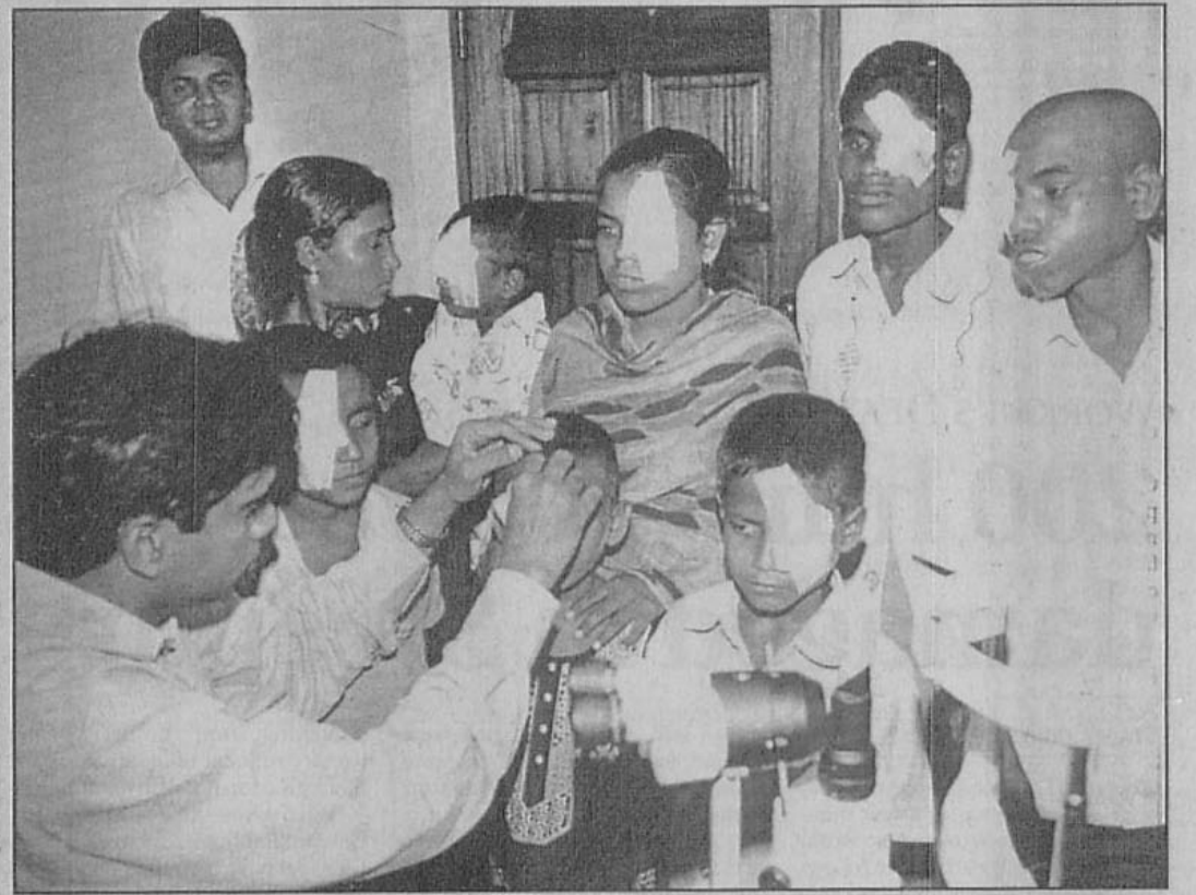
The doctor makes sure these visually challenged underprivileged children regain their eyesight at Bangladesh Eye Hospital in the city yesterday.

About the Ahmadiyya, they said Jamaat considers Ahmadiyyas as non-Muslims, but they have their right to practise their belief and none should take up laws in their own hands.