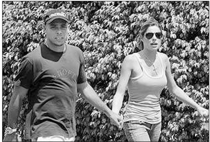
THAT'S HISTORY! Superstar Ronaldo (L) and Daniella Cicarelli walking hand in hand during better times. The couple announced that they were splitting on Wednesday.

"I can understand with the fans that he is highly loved and he deserves it. But I have to make my decisions," Wenger warned.