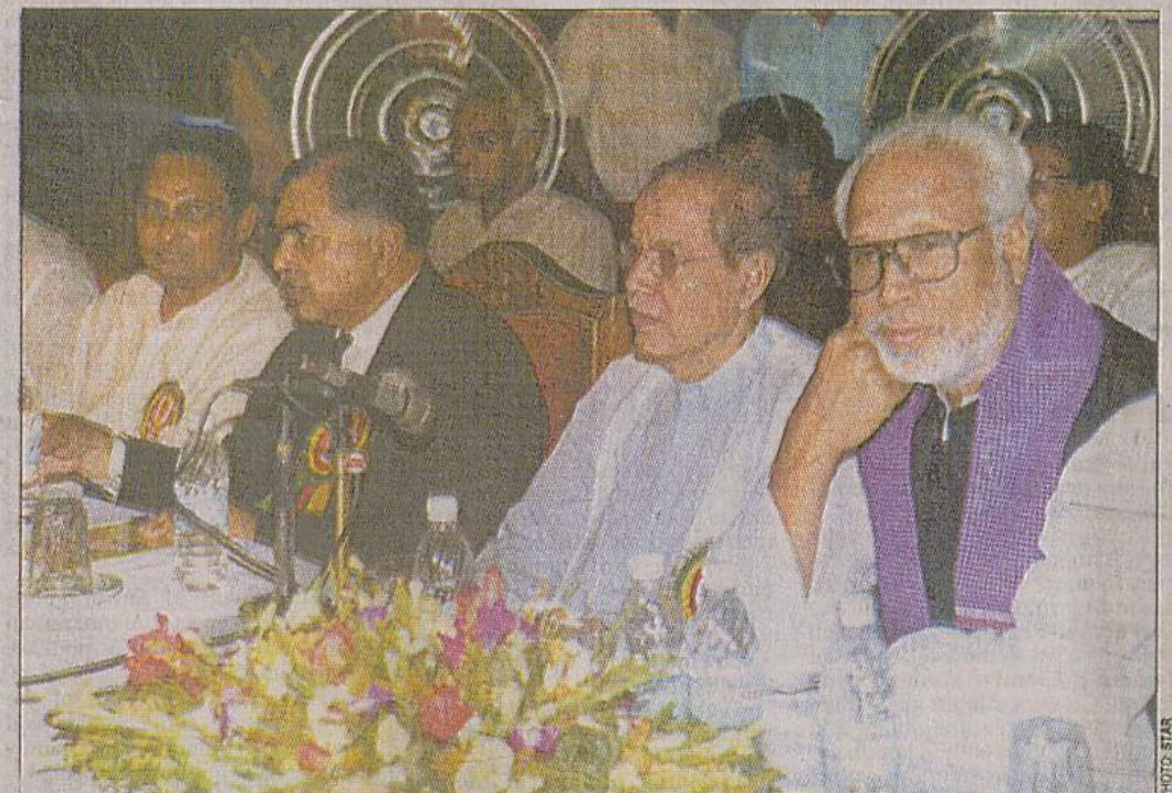
Chiefs, from right to left, of Bangladesh Krishak Sramik Janata League Kader Siddiqui, Bikalpa Dhara Bangladesh (BDB) AQM Badruddoza Chowdhury, Gono Forum Dr Kamal Hossain and Jatiya Samajtantrik Dal Hasanul Haq Inu listen to a speaker at a discussion in the capital marking BDB's first founding anniversary yesterday.