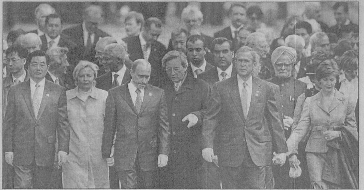
(L to R) Chinese President Hu Jintao, Ludmila Putin, Russian President Vladimir Putin, Luxemburg Prime Minister Jean-Claude Juncker, US President George W. Bush, his wife Laure, Indian Prime Minister Manmohan Singh and other heads of state walk to the place for a family picture after a joint wreath laying ceremony at the Tomb of the Unknown Soldiers on Monday near the Kremlin in Moscow, during the celebrations marking the 60th anniversary of the Allied victory over Nazi Germany in WWII. Nearly 60 heads of state and government and other leading international dignitaries took part in the festivities in Moscow.

Russian leader prepared to play host on Monday to dozens of world dignitaries at a parade on the 60th anniversary of the defeat of Nazi Germany.