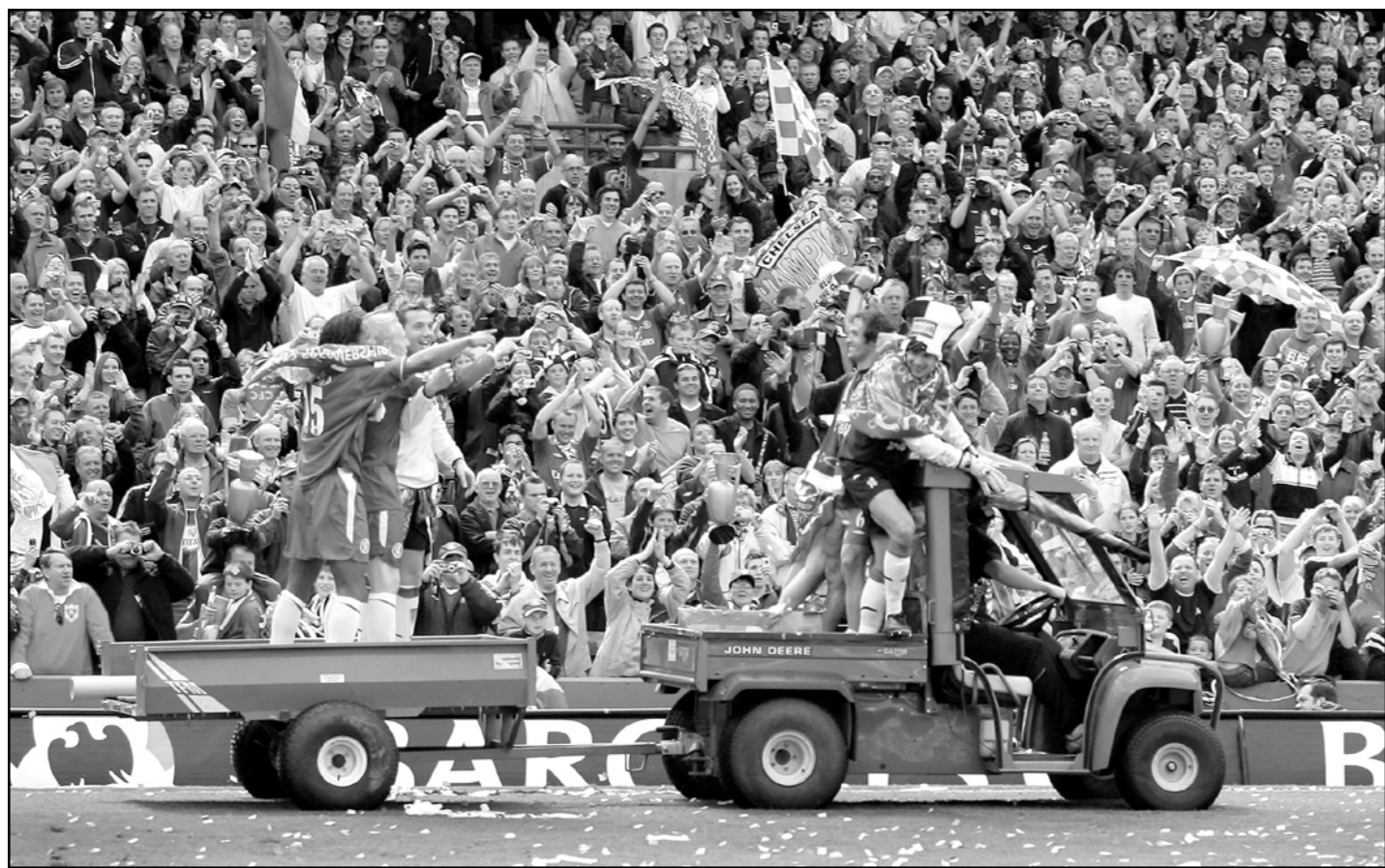
THE CHELSEA CARAVAN: Chelsea players Didier Drogba (L) and Mikael Forsell (2nd L) ride around the pitch on a groundsman buggy during the celebrations following the game against Charlton at Stamford Bridge in London on Saturday.