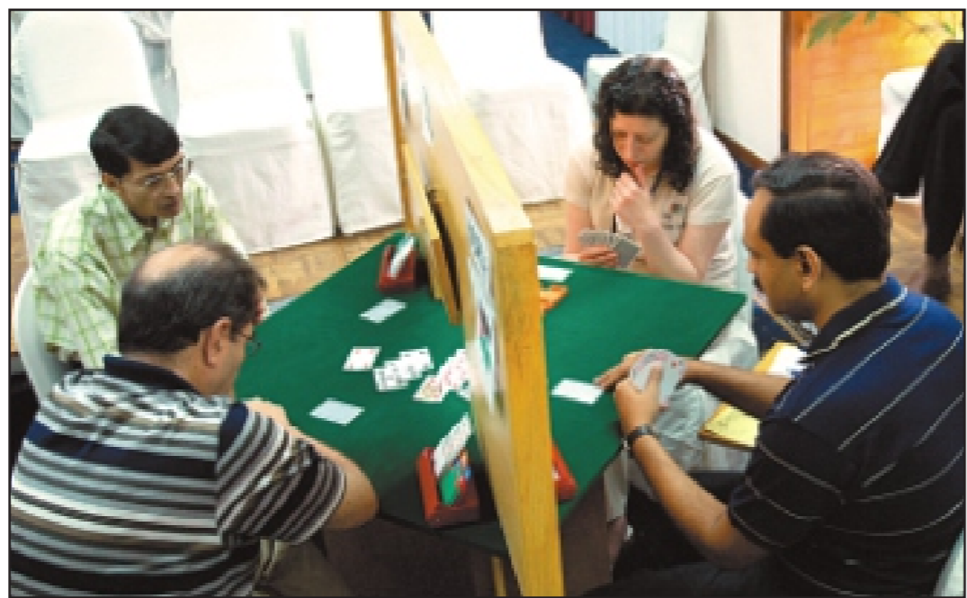
Scene from yesterday's Asia and Middle East Regional Bridge Championships Open team event final between India and Jordan at Hotel Sonargaon.

The Indian eves recorded a more convincing 132-58 win over Pakistan in the women's final, also carried from Thursday.