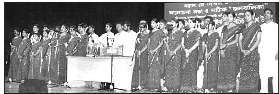
Garment workers present a song at the cultural show

The main attraction of the programme was the participation of 30 garment workers of the Finery Limited, rendering the songs of people and hope in front of a sizable audience. Starting with Rabindranath Tagore's