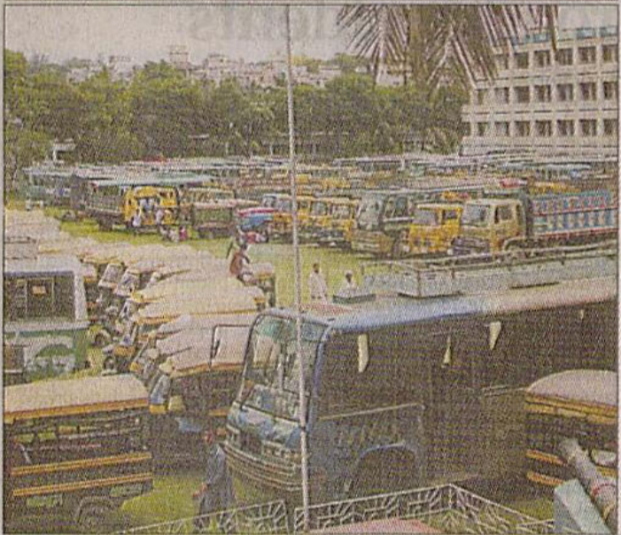
Sports organisers take out a truck procession in the port city in support of CCC mayoral candidate ABM Mohiuddin Chowdhury, top, and the vehicles requisitioned by the authorities to use in Monday's polls are parked in the police lines ground yesterday.