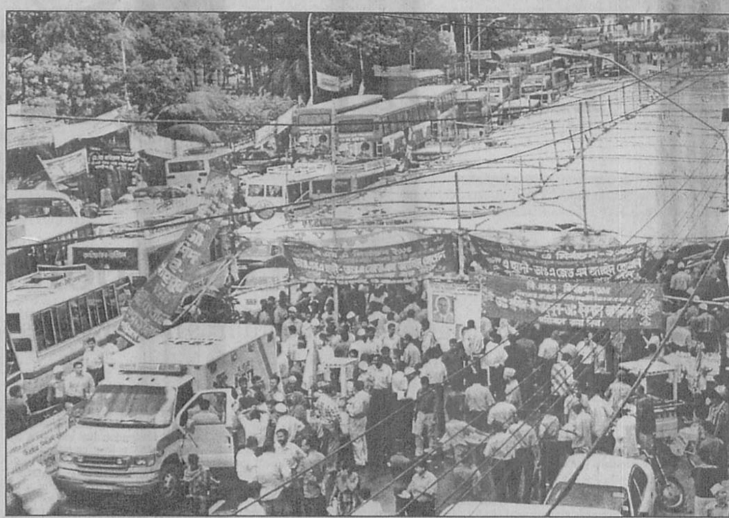
Commuters experience a huge traffic congestion yesterday as the Tophkana Road was blocked all day to facilitate the BMA election.

The decision to demolish illegal structures from the city canals in and around the capital for smooth functioning of the drainage system was taken in an inter-ministerial meeting by the Local Government and Rural Development (LGRD) and Cooperative Ministry in February this year.