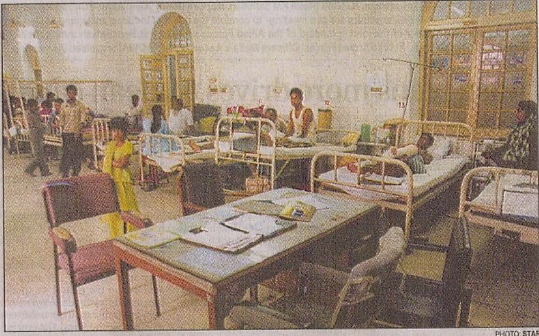
DUCKING DUTY: Patients lie unattended at the Orthopaedic Ward of Dhaka Medical College and Hospital late yesterday morning, as doctors cared little about their duty and preferred to vote in the Bangladesh Medical Association election that ran through the day.

Millions vote to hand Blair third term AFP, London Millions of Britons voted yesterday in a general election widely expected to hand Prime Minister Tony Blair's Labour Party an historic third successive victory, even though he has lost trust over the war in Iraq. A smiling Blair, accompanied by his wife Cherie, cast a vote in his northern English constituency of Sedgefield, where he is being SEE PAGE 19 COL 1 AL plans to form 2 units in Dhaka city STAFF CORRESPONDENT The Awami League (AL) high-command has planned to divide the party's Dhaka City unit into two parts to strengthen organisational activities in the capital and get rid of feud between top leaders of the present committee. The party policymakers are likely to discuss the issue at its central SEE PAGE 19 COL 6 Bomb found at N'ganj Proshika office OUR CORRESPONDENT, N'ganj Police on Wednesday seized a bomb from a local office of Proshika in Bandar Upazila Shabi Masjid area. The seizure has created panic among the Proshika staff. Bandar police said they seized the bomb from the guest room of the office at around 11:00pm. The bomb is now with the police, who are trying to find out who kept the bomb there and why.