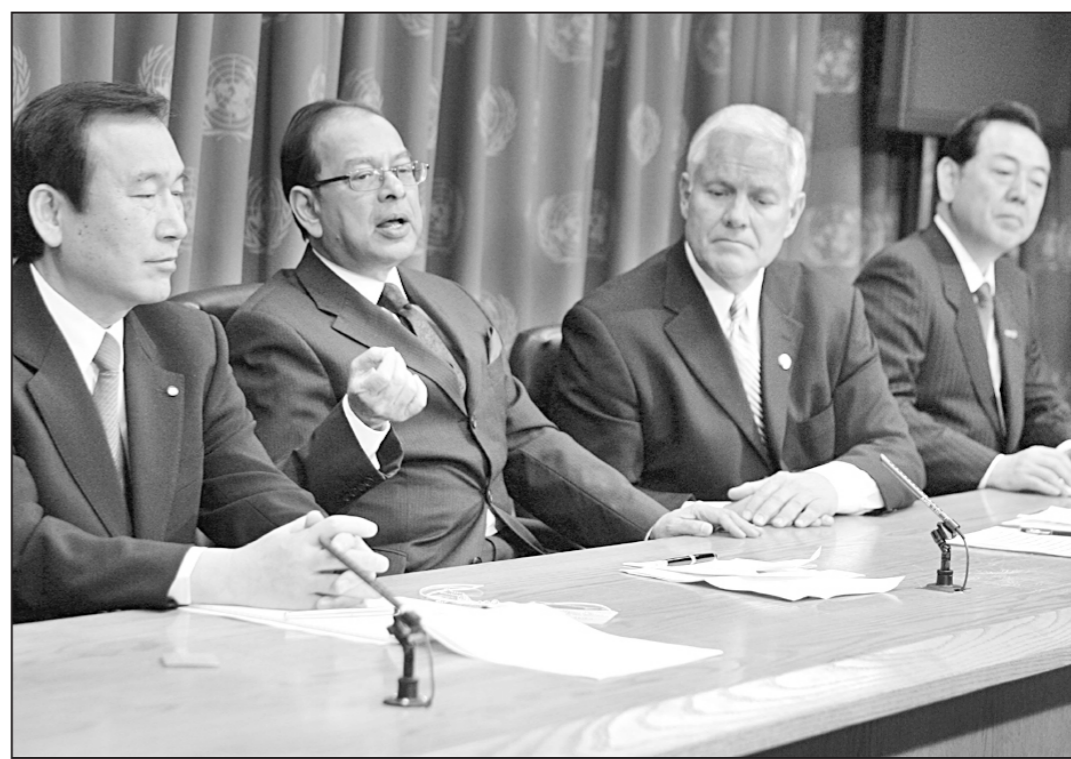
Bangladesh's ambassador to the United Nations Iftekhar Ahmed Chowdhury (2nd L), Mayor Tadatoshi Akiba (L) of Hiroshima, Mayor Donald L. Plusquellic (2nd R) of Akron, Ohio and Nagasaki Mayor Kazunaga Itoh (R) take part in a discussion on the non-proliferation of nuclear weapons on Tuesday at the UN in New York, on the sidelines of a UN conference on nuclear proliferation.

Two Pakistani security officials told the Associated Press the men were held after a gun battle in Mardan, 50km (30 miles) north of Peshawar, capital of North-West Frontier Province.