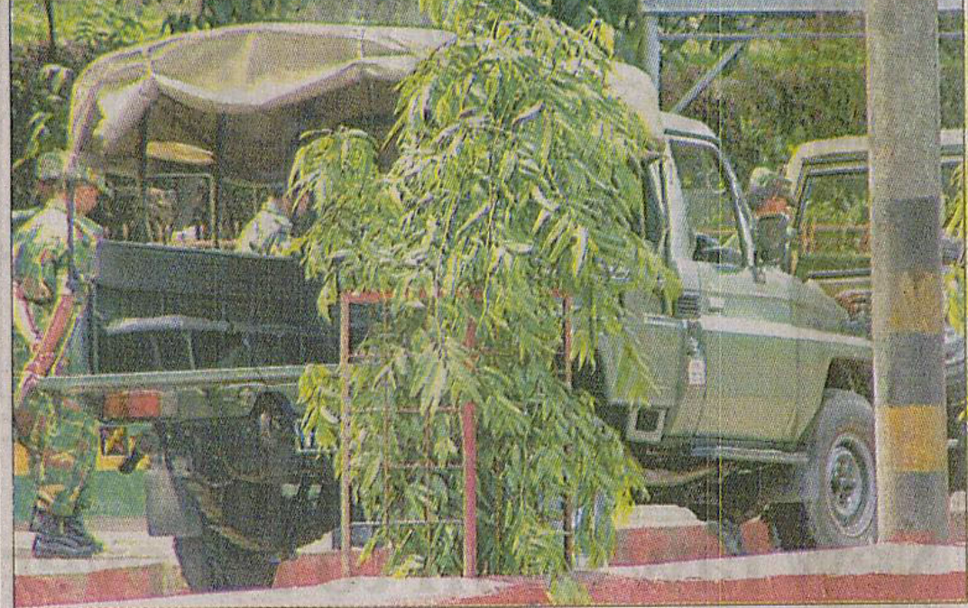
Army personnel patrol Chittagong city to assess the pre-poll situation yesterday, five days ahead of the Chittagong City Corporation mayoral elections.