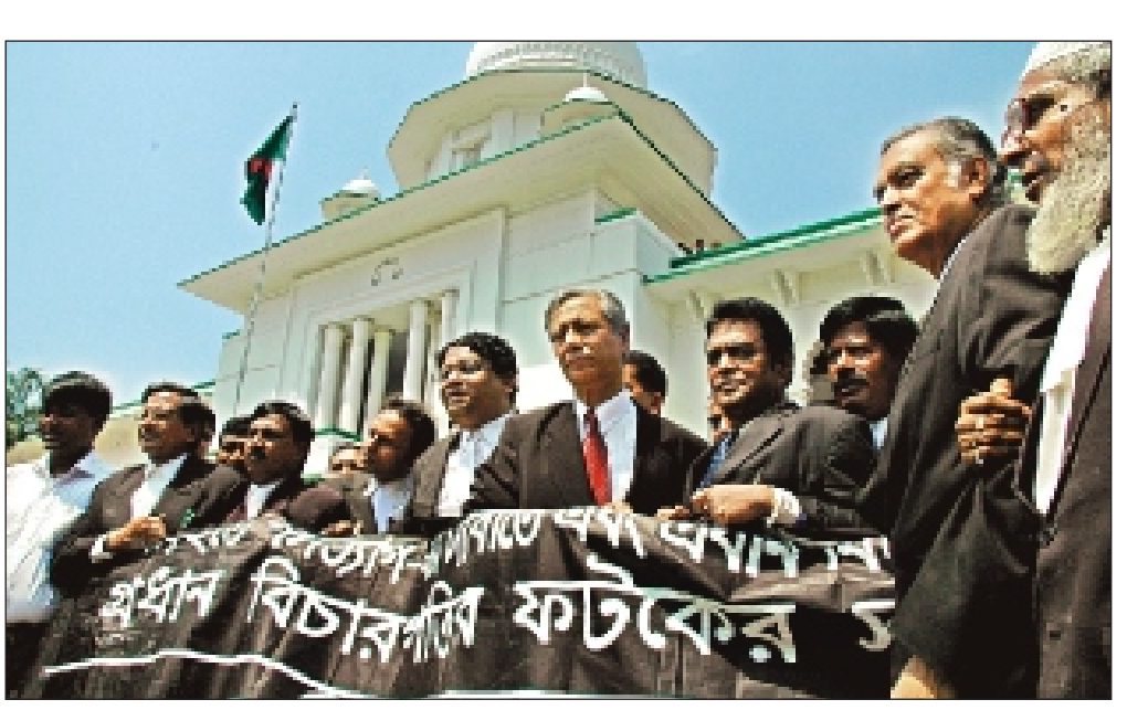
Supreme Court Bar Association (SCBA) takes out a procession following a two-hour sit-in at the chief justice's entryway to the court yesterday demanding removal of Additional High Court Judge Faisal Mahmud Faizee.

During the demonstration, the SEE PAGE 15 COL 6