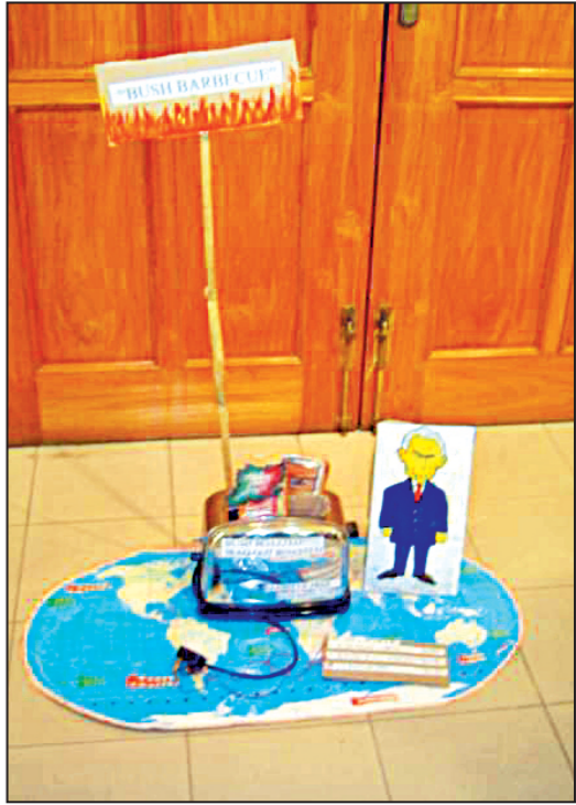
A 3D cartoon at the exhibition

Cartoons began with black and white sketches during the late 19th century in France and England. In Bangladesh the Liberation War brought in experts like Rafiqun Nabi, who lampooned the life around him and worldwide. The vision of the young cartoonists was also mind-boggling. The message is instantaneous; no stone is left unturned in the search for subjects to delineate. The cartoons make one smile, if not hold one's sides with laughter. Each time one pauses to drink deep of the treasure trove of fun and banter. The wit and humour range from the caustic to the mild. One laughed and one felt that the world laughed with one. As a mark of appreciation of the promising cartoonists' unmitigated