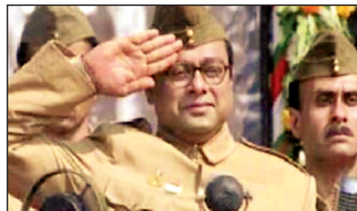
A scene from the film, Bose - The Forgotten Hero