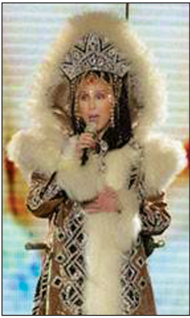
Cher in full regalia at her final concert