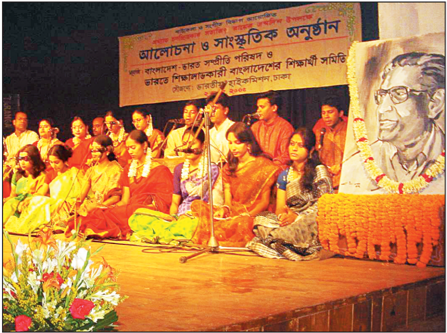
Artistes performing at the show