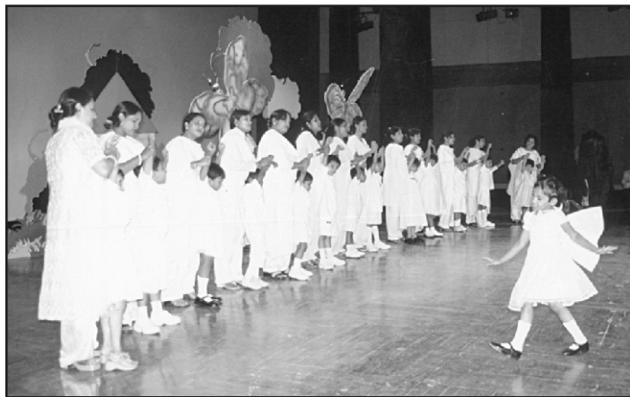
Children put their best foot forward

Hard work went into putting up the show, recall AWF teachers. For the last two months, the students had gone through regular rehearsals. Even otherwise, they say, songs, dances, art, plays and physical