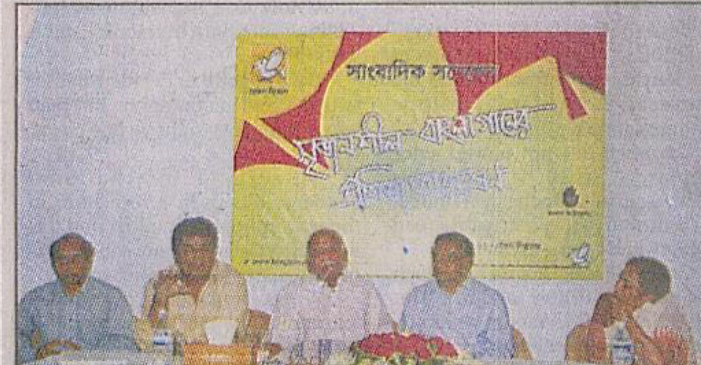
Eminent cultural personalities and organisers at the press conference

The winners would be awarded and Bengal Foundation would also release music albums by the winners.