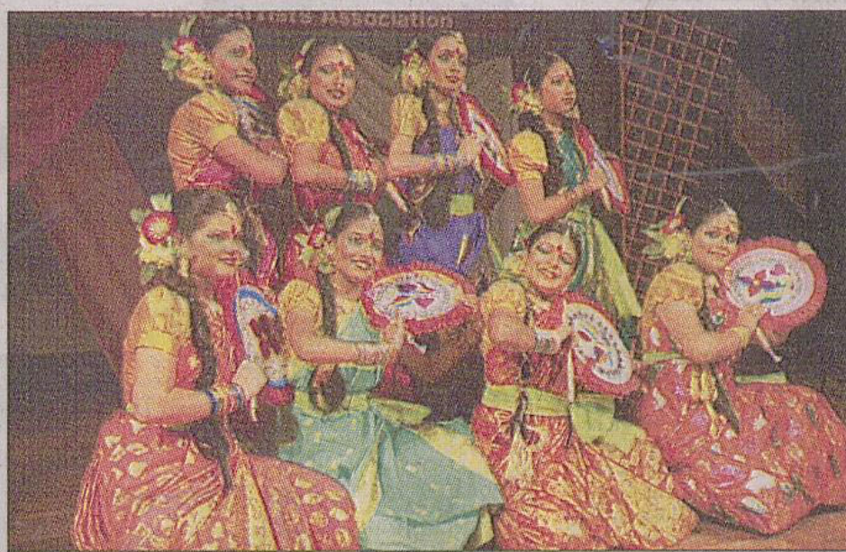
Artistes performing traditional dance numbers at the festival