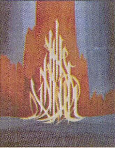
Two calligraphy works from the display

One came away from the veritable treasure trove of Islamic art, surfeit with gain in knowledge.