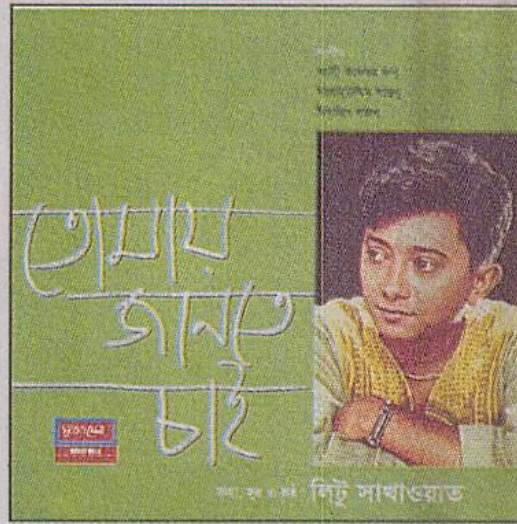
The cover jacket of the album

The track Chandey chandey bela jaayre gives a very traditional folk essence with a nice lyric while Jatobar tumi testifies to the influence of Sumon Chattapadhyay (now Kabir Sumon) in both the lyric and tune. Interestingly, the song Hey bondhu has the typical flavour of